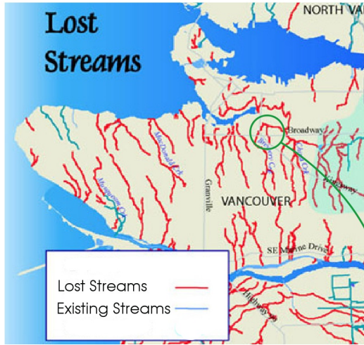
This map shows the streams that used to flow through Vancouver, Richmond, and Burnaby. St. George Creek (circled) used to flow down False Creek Flats and then into False Creek.